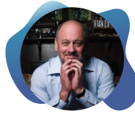
Professor Tim Flannery Australian climate change leader